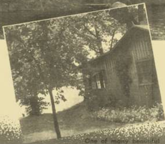
One of many beautiful cabins on Boy Lake